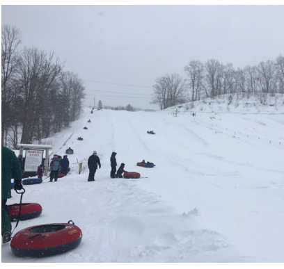
Tubing fun at Hanson Hills in Grayling, MI