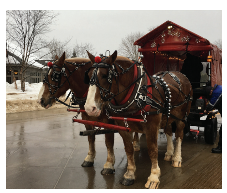
Our families enjoyed a surrey ride through Crystal Mountain Resort in Benzie County!!